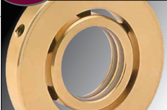
The Inpro/Seal Smart CDR and Smart MGS use proprietary conductive filaments to divert harmful stray shaft currents away from the bearings to ground.

Inpro/Seal Smart Shaft Grounding maximizes equipment reliability, reduces costly maintenance and minimizes unscheduled downtime.