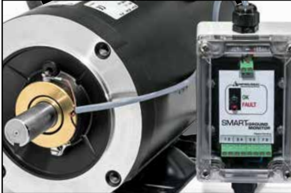
The Smart CDR™ connected to the Smart Ground Monitor™ provides users with instant feedback on shaft grounding performance.