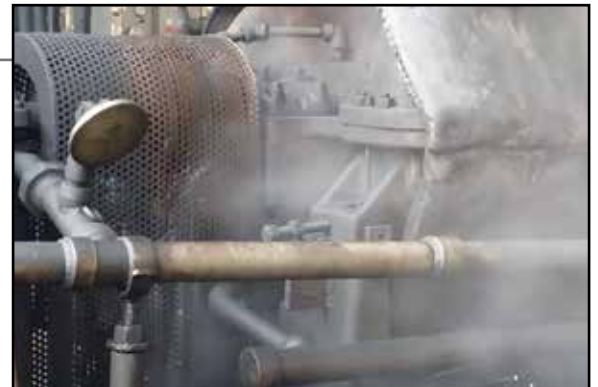
Steam leakage on process steam turbines increases steam costs and leads to lower efficiency and steam turbine performance.

Three times more effective than carbon rings, the Inpro/Seal Sentinel FBS reduces maintenance costs, downtime and steam loss with increased performance.