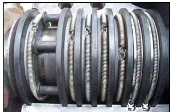
Typically, two Sentinel FBS's are installed in each gland box to provide superior sealing protection.