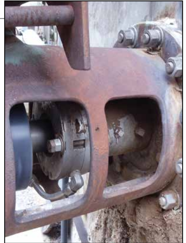
A stainless steel Air Mizer shaft seal installed on a side entry agitator eliminates product waste and contamination.

Inpro/Seal Air Mizer's unique non-contacting designs have no wearing parts and are intended to last the lifetime of your equipment.