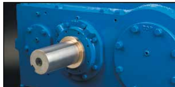
Inpro/Seal Bearing Isolators are installed on motors, pumps, pillow blocks, gearboxes and many other types of rotating equipment.