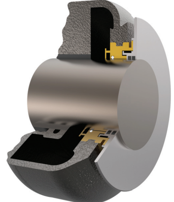
Above 400°F [200°C]

Unscheduled downtime can be costly, but don't worry, Inpro/Seal has you covered. We've streamlined our operation process to offer same day shipments, even on new designs, to get your equipment running right away.