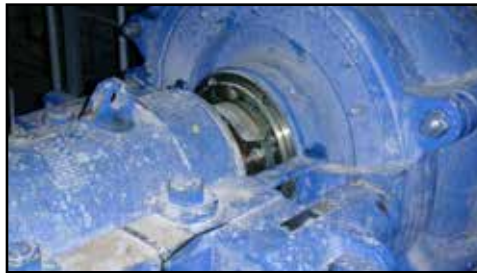
Slurry pump with Inpro/Seal Bearing Isolator

Slurry pumps are large centrifugal pumps, deployed heavily in the mining industry, that move slurry mixtures throughout the process. The slurries are very abrasive, making it challenging to seal the equipment effectively. The slurry quickly deteriorates standard seals, including lip seals, allowing the mixture to enter the bearing housing and cause bearing failure. This leads to unscheduled downtime and high maintenance costs due to frequent bearing assembly changes, including shafts, bearings and seals.