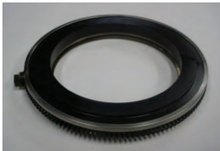
Low Pressure Seal Side (Carbon Element)