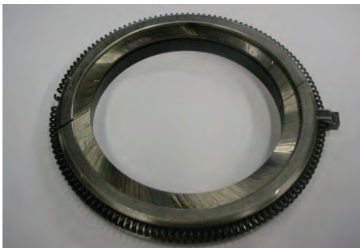
High Pressure Seal Side (Brush)