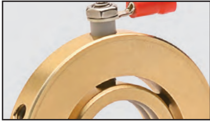
The Smart CDR's shaft sleeve, conductive fibers and Smart terminal provides premium shaft grounding performance.

Protect bearings from stray shaft currents and improve the reliability of VFD-driven equipment with the Smart CDR shaft grounding solution, the next-generation of shaft grounding technology from Inpro/Seal®.