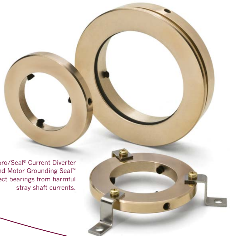
The Inpro/Seal® Current Diverter Ring™ and Motor Grounding Seal™ protect bearings from harmful stray shaft currents.

Diverting shaft currents and controlling EDM needs to be a priority for your business. Various methods have been used over the years to mitigate shaft currents, but they have all had limitations...until now.