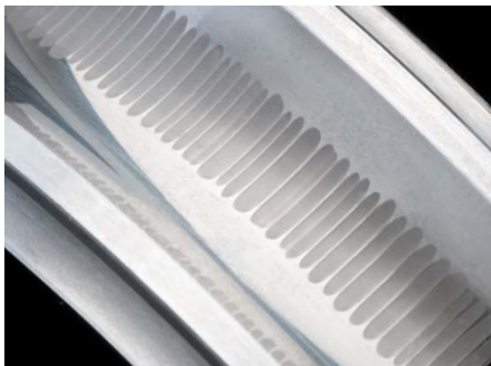
Stray shaft currents discharging through the bearings on rotating equipment can cause fluting on the bearing race, resulting in premature bearing failure.

VFDs are capable of inducing high frequency voltages on the shaft that seek a path to ground through the motor’s bearings or the bearings of the coupled equipment. When these voltages exceed the insulation breakdown of the lubricant, they discharge through the bearings to ground.